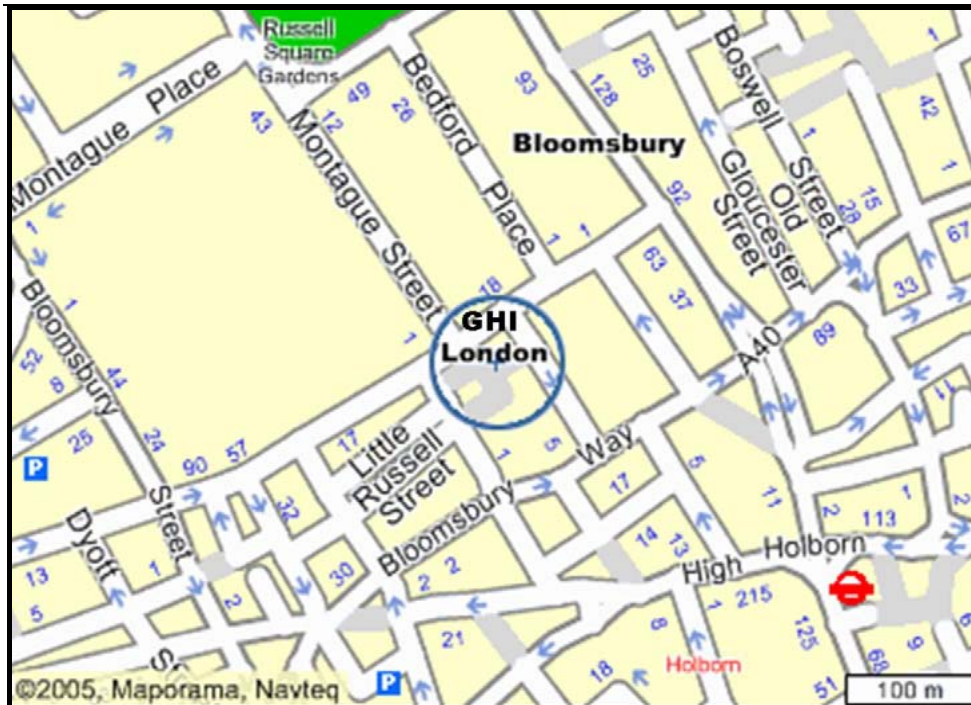
Nearest Tube Station to Institute: Holborn (Piccadilly and Central Line)