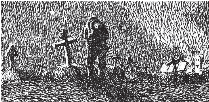
Illustration 6: The Battlefield II (1916)