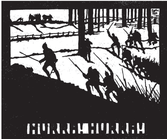
Illustration 5: The Battlefield I (1914)