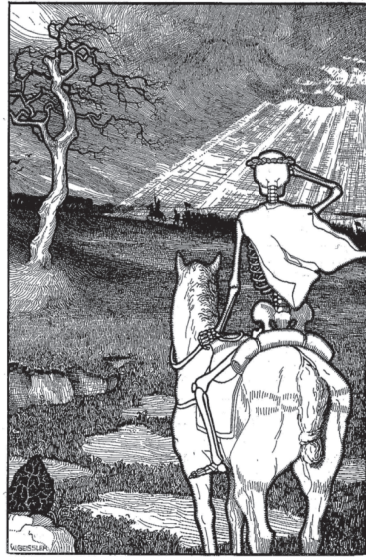
Illustration 2: Sieger Tod (A Victor's Death)