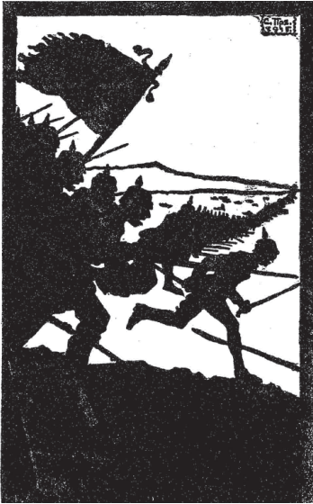
Illustration 1: Der Sturm (The Storm)