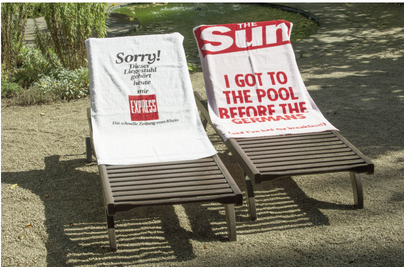
Fig. 1: The War of the Towels

The German–British war of the towels for pool chairs was waged mainly in the tabloids. German Express: ‘Sorry! This pool chair is mine for today’; British Sun: ‘I got to the pool before the Germans (and I’ve had my breakfast!).’