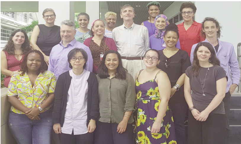
Workshop participants at the University of the West Indies, Mona Campus, December 2019.

After hundreds of emails, tens of thousands of flight miles (yes, also with a large carbon footprint), and dozens of visa support letters, and, sadly, not always successful visa applications, the workshop also created a platform for those who otherwise do not easily have access to this kind of exchange. Yet legacies of colonialism also became a hindrance and thus pertinent in the workshop planning itself. Although I started planning a year ahead and finalized a draft programme in summer 2019, the line-up kept changing until the very last minute. This was due to visa rejections or expiring residency permits; incidents rarely experienced by people with passports from 'the West'. Others, although they made it, were questioned at borders. Flight routes leading through former centres of power such as London meant that fares were either expensive or required further transit visas, and that routes were cumbersome. These issues, and the fact that many museums and countries do not have reliable internet connections to access our blogs and podcasts, were discussed at the workshop itself.