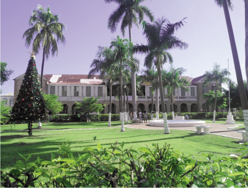
Christmas Tree, Emancipation Square, Spanish Town, Jamaica.

trees in those very squares, surrounded by palm trees. It is also here that the kernel of London's British Museum and Natural History Museum collection was compiled by Sir Hans Sloane in the eighteenth century. The transatlantic slave trade provided the infrastructure that allowed Sloane and his European contemporaries to build their collections, and supplied specimens for Sloane and others, as James Delbourgo has compellingly shown in his book Collecting the World . 1