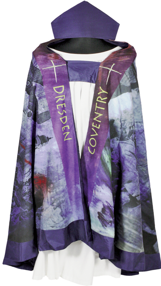
Fig. 2: Coventry–Dresden Cope

Photograph credit: Stiftung Haus der Geschichte/Axel Thünker. Reprinted by permission.