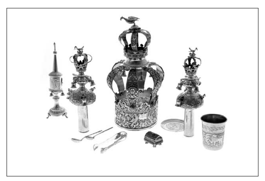
Illustration 3. Silver objects.

or the newspapers of the time that would help us to identify the provenance of these objects. The hallmarks in the silver made it possible to identify when and where the objects were crafted. This trace led to the east, to the Ukraine, Poland, and Russia. But how did they get to Bregenz? The curators cannot give the visitors more than questions. Did a Nazi bring them back on his return from 'duties' in the east and try to sell them after the war? Did a refugee from 1938 leave this package in Bregenz? Did the objects belong to a Jewish DP after 1945 who was trying to smuggle them into Switzerland? Or did a non-Jewish DP from the Ukraine try to sell them in Vorarlberg? The story of lost and found remains open, and when visitors walk down the staircase of the museum and again see the witty old woman's remarks about bringing along stuff in the dark, different answers to this question have emerged into the light.<sup>8</sup>