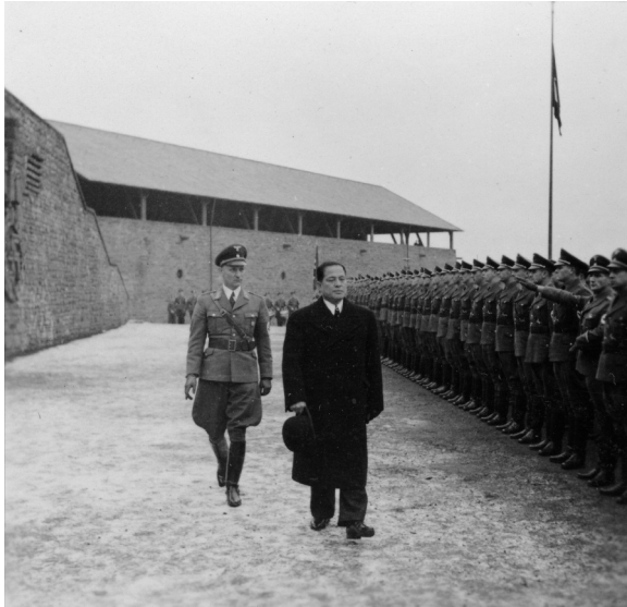
Illustration 2: Visit of the Japanese Ambassador, Lieutenant General Oshima, to Ordensburg Vogelsang in January 1939

sions. Across societies, austerity policies dominated at the beginning of the decade, and social programmes had to face the criticisms of economic orthodoxy. Yet the Nazis continued or launched a whole host of programmes, ranging from job-creation schemes to leisure-time programmes and pro- and anti-natalist policies. And they were not alone in doing so. In fact, many European and non-European states intensely debated and introduced new welfare measures at the time. Social security, to give but one example, was introduced or reformed in various parts of the world, including Sweden, France, Canada, Brazil, and New Zealand. To contemporaries, such schemes often appeared radical, risky, and overly expensive. States around the world—and Nazi Germany was by no means an exception—collected information about practices elsewhere in order to relate their own efforts to them. 28 (See Ill. 2.)