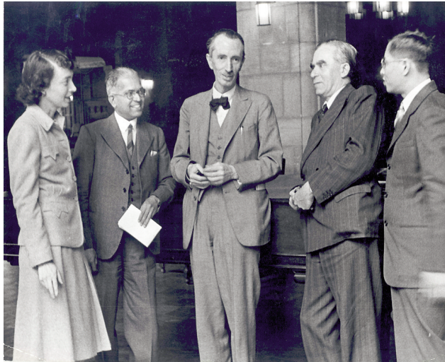
Illustration 5: International Labour Conference in Philadelphia, April-May 1944