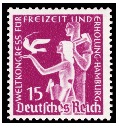
Illustration 4: German Commemorative Stamp for the World Congress of Recreation in Hamburg, 1936

Germans were by no means the only ones basing comparative arguments on statistical evidence and other forms of expert knowledge. The 1942 Beveridge Report, for instance, included a separate appendix that compared British social insurance with that of other states, including Allied countries (among others, Australia, Canada,